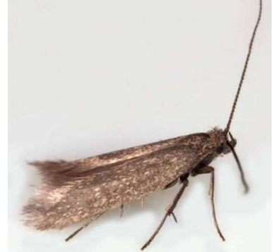
Photo right: Amphisbatis incongruella, New Forest, 25 Mar